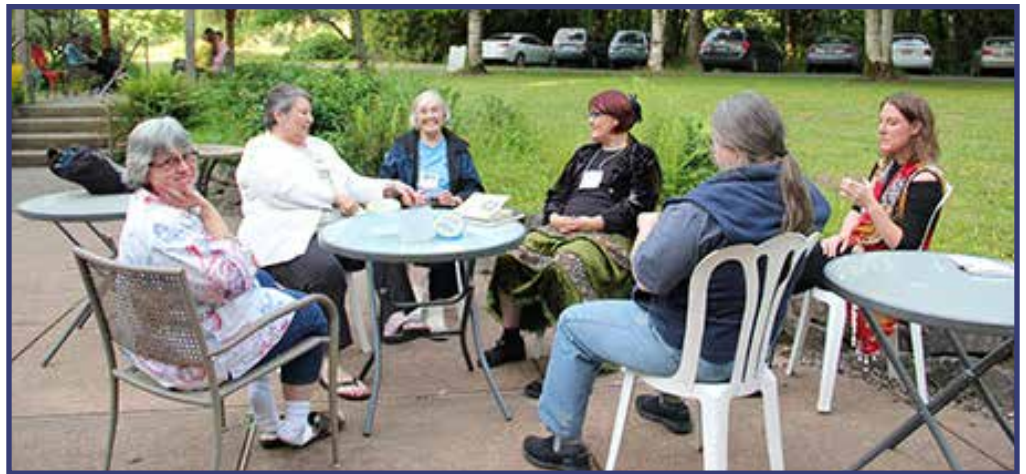
Women's Retreat 2018

For more information, contact any of the planning team members.